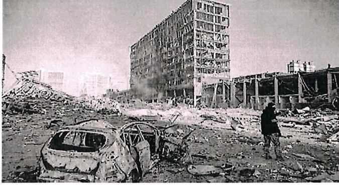
such jets are essential to challenging Russia's air superiority and ensuring success in a Russian offensive that Reznikov predicted could begin around the war's one-year anniversary...